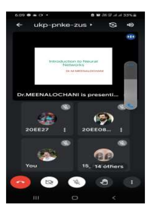
Dr.M.Meenalochani AP/EEE delivering lecture (online mode) during Internal Seminar